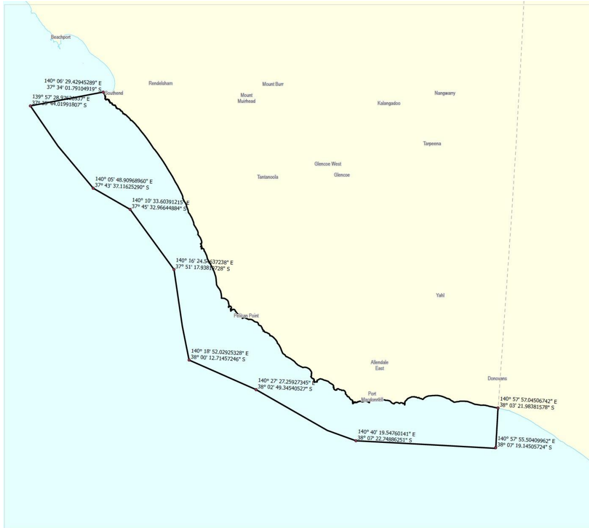
MAP OF AREA DESCRIBED

The coastal waters of the south east of South Australia contained within and bounded by a line commencing at the point 38°03'21.9838" South 140°57'57.0451" East, then southerly to the point 38°07'19.1451" South 140°57'55.5040" East, then westerly to the point 38°07'22.7489" South 140°40'19.5476" East, then north-westerly to the point 38°02'49.3454" South 140°27'27.2593" East, then further north-westerly to the point 38°00'12.7146" South 140°18'52.0293" East then further north-westerly to the point 37°51'17.9382" South 140°16'24.5464" East then further north-westerly to the point 37°45'32.9664" South 140°10'33.6039" East then further north-westerly to the point 37°43'38.1163" South 140°05'48.9097" East then further north-westerly to the point 37°35'44.0199" South 139°57'28.9763" East then north-easterly to the point closest to Mean High Water Springs at 37°34'01.7910" South 140°06'29.4295 then south-easterly along the line of Mean High Water Springs to the point of commencement (GDA2020).