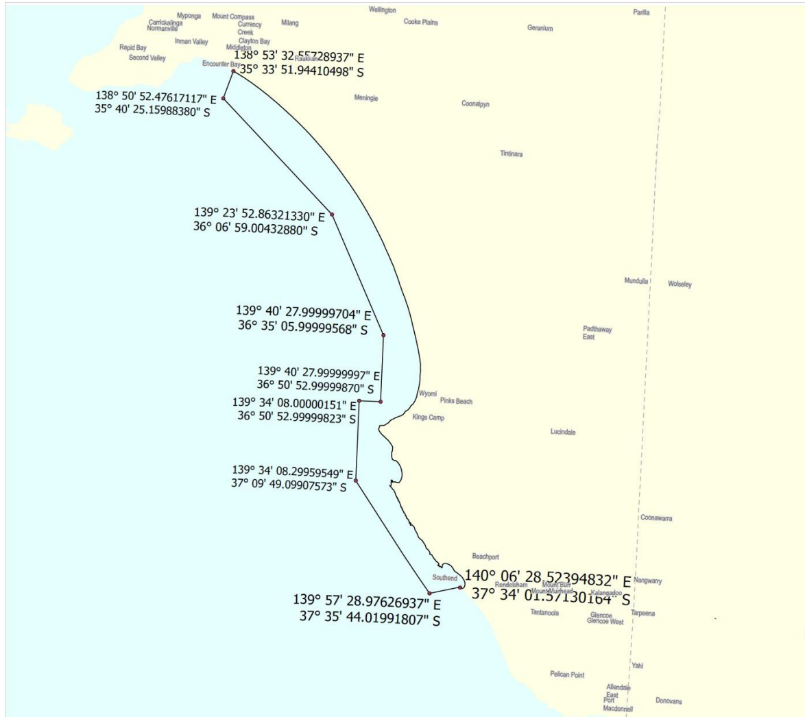
MAP OF AREA DESCRIBED

This Notice will be in effect from 23:59 5 March 2024 and remain in force until 23:59 27 March 2024 unless amended or revoked by a subsequent Notice