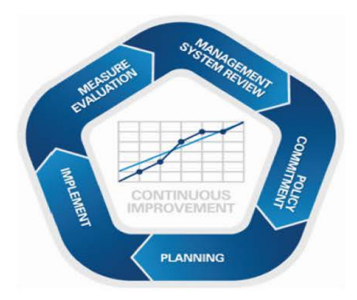
Diagram 1 –Continuous improvement model

**Unless otherwise stated the element requirements apply to all disciplines ie, WHS, rehabilitation and claims.